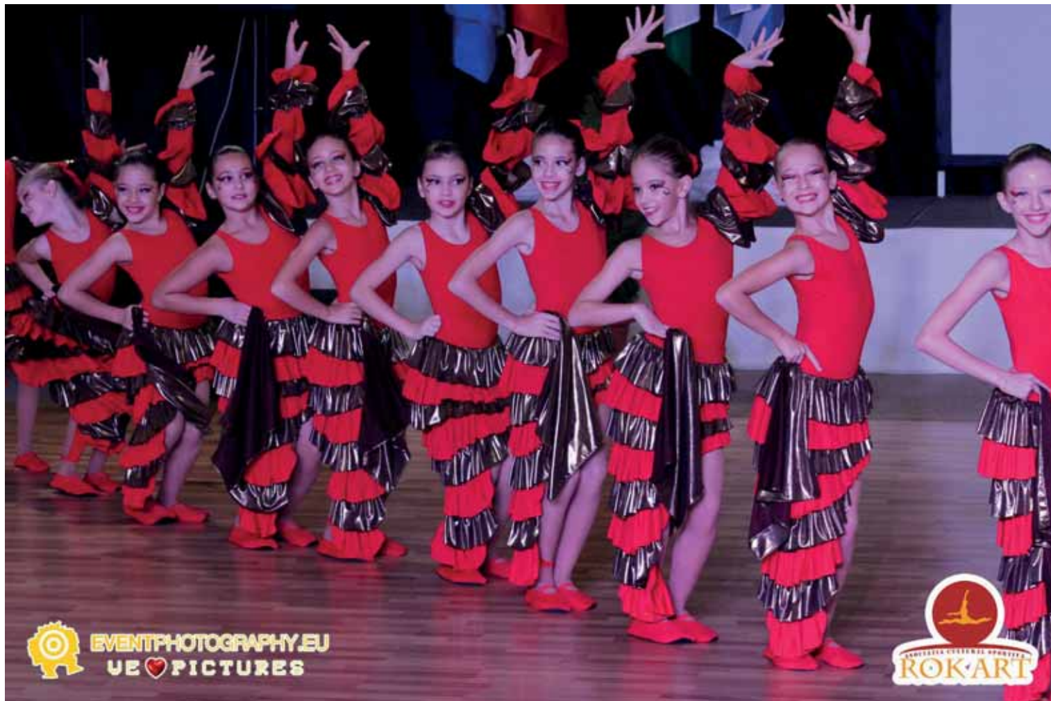
RONA Dance Club - Haskovo Belly Dance Show Solo Youth+Adults